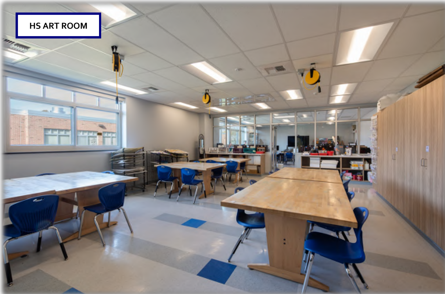
HS ART ROOM